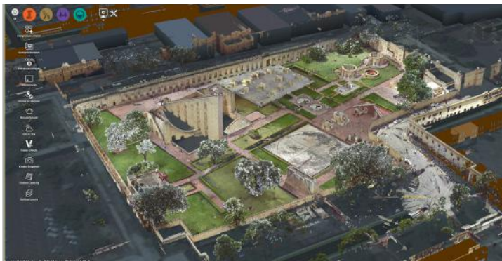
Unified LiDAR data of Jantar Mantar in Infracore360