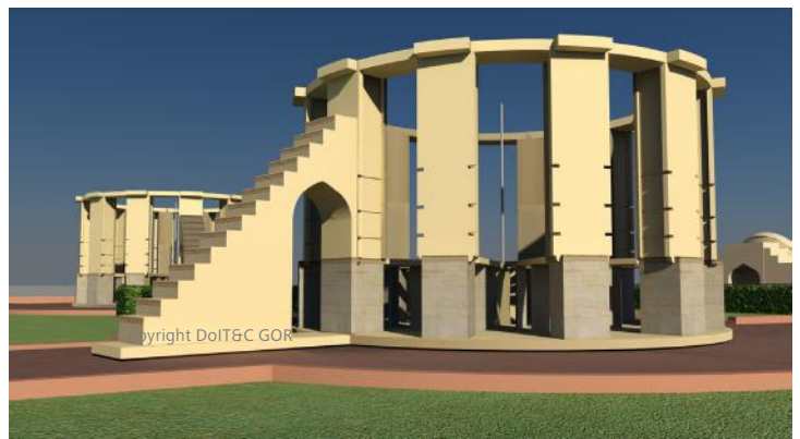
3D model of Jantar Mantar instrument - Image Courtesy: DoIT&C