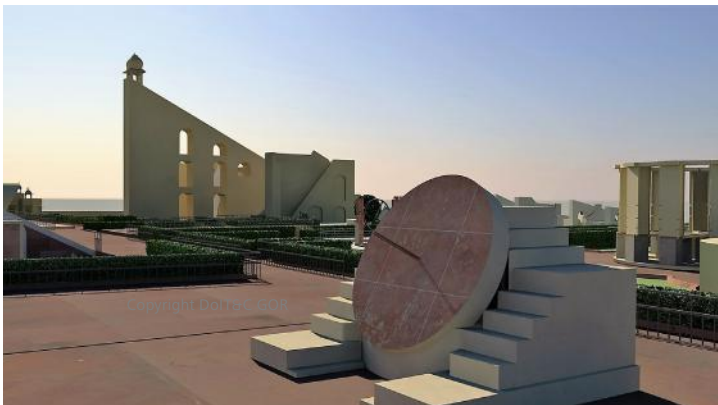
3D Model of Brihat Samrat Yantra on Left and Kranti Yantra on right - Image Courtesy: DoIT&C

Autodesk [and other products] are registered trademarks or trademarks of Autodesk, Inc., and/or its subsidiaries and/or affiliates in the USA and/or other countries. All other brand names, product names, or trademarks belong to their respective holders. Autodesk reserves the right to alter product and services offerings, and specifications and pricing at any time without notice, and is not responsible for typographical or graphical errors that may appear in this document. © 2016 Autodesk, Inc. All rights reserved.