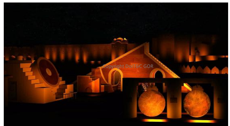
Digital Prototyping of Sound & Light Show for Jantar Mantar