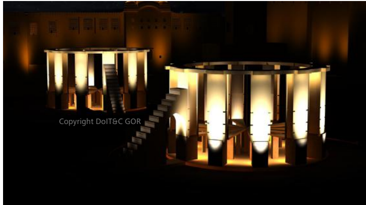
3D Model of Ram Yantra in Sound & Light Show

New buildings, facades coming up around heritage monuments too can be modelled on them, so as to be in sync with the old world charm.