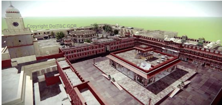
3D Model of Jaipur City Palace