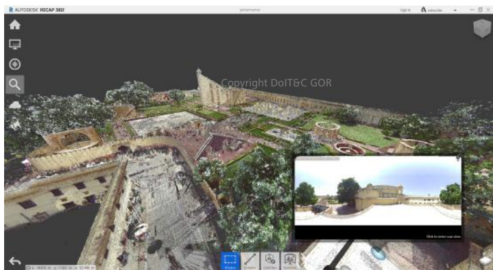
Point Cloud Data with panoramic view images of Jantar Mantar. The same can be viewed in ReCAP 360 on web portal as well for internal use - Image Courtesy: DoIT&C

“This is a welcome move by the Government of Rajasthan. We are known for our qualitative culture & heritage and such initiatives will help to keep them alive forever.”