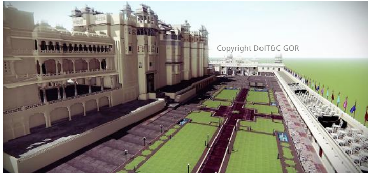
3D Model of Udaipur City Palace

Most palaces in Rajasthan offer sound and light shows. Digital modelling, animation can be created on these models to run digital prototyping first rather than investing and damaging monuments for physical prototyping.