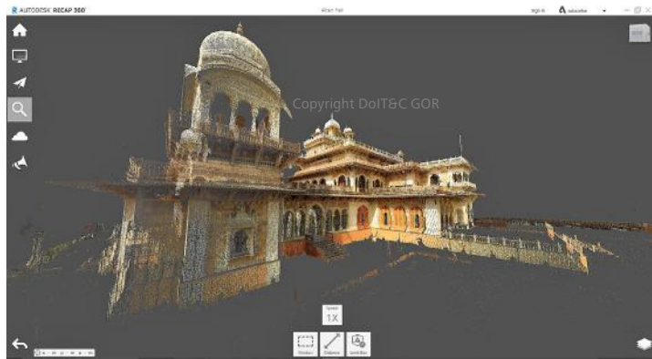
LiDAR point cloud data of Albert Hall in Autodesk ReCAP 360 Pro