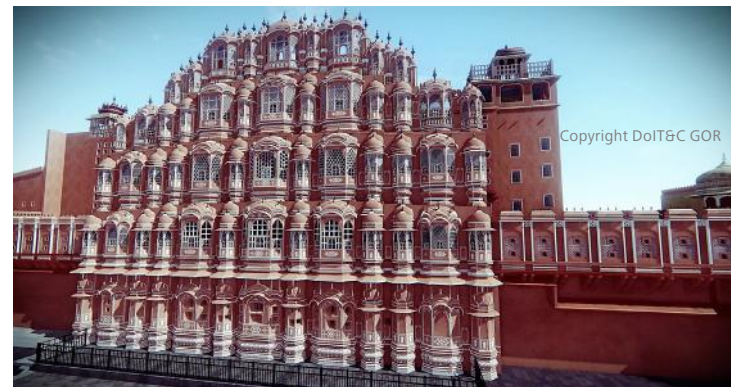
3D Model of Hawa Mahal, Jaipur

Department of Information Technology & Communication (DoIT&C) is working to put technology to its highest and best use throughout Rajasthan Government Departments/ Autonomous Bodies to improve the administration of State programmes and services. Providing guidance on technical matters to Departments, vetting IT projects and taking Department on achieving IT Road Map are the basic jobs of Department of Information Technology & Communication (DoIT&C).