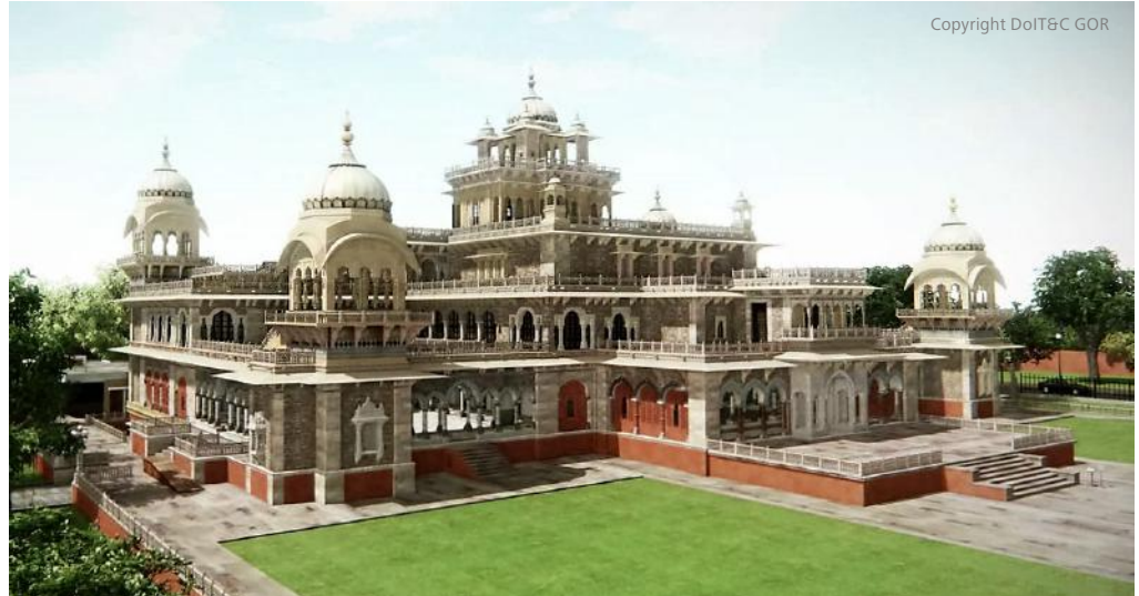
Rendered image of 3D model- Albert Hall, Jaipur

Heritage structures affected by natural calamities can now be safeguarded with the help of to the scale 3D models.